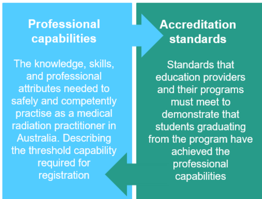
Figure 2: Relationship between professional capabilities and accreditation standards